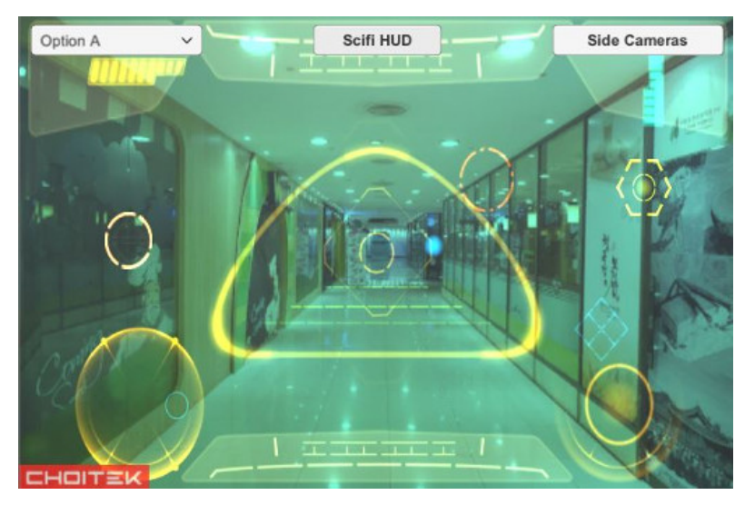
Super cool science fiction style overlay.

In the upper middle of the main view, click on the scifi HuD button to toggle a super cool science fiction style overlay on the main camera view.